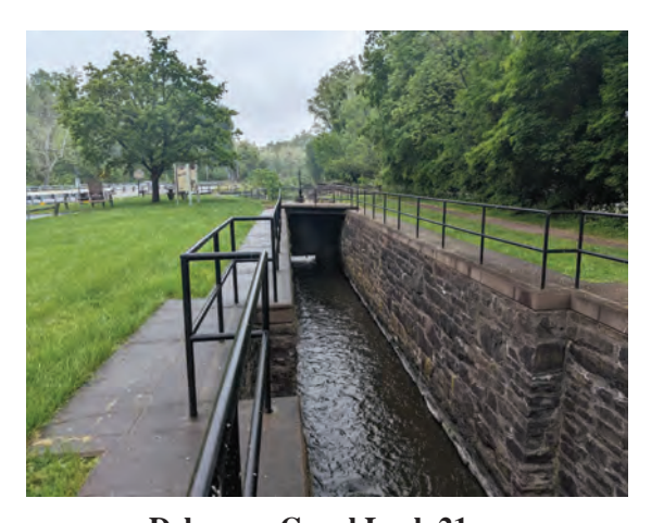
Delaware Canal Lock 21