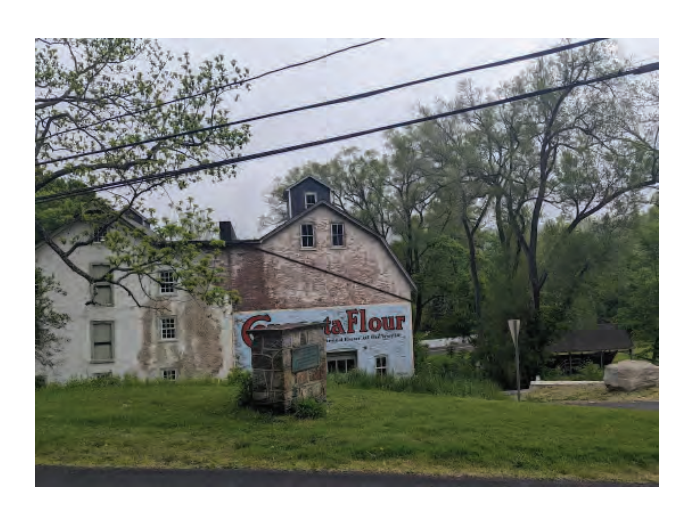
Durham Mill - 1819

The Durham Feed Mill built in 1819 is on the site of the Durham Furnace, built in 1727 and operated until 1908. This was an important point to canal shipping.