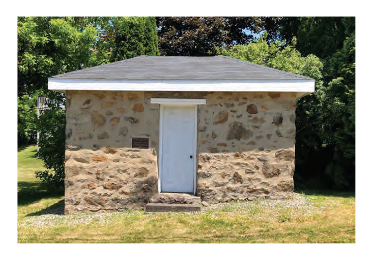
Hellertown Jail - 1872

The small stone building which stands a few yards from you at a bearing of 144 degrees is the first jail in Hellertown, built in 1872.