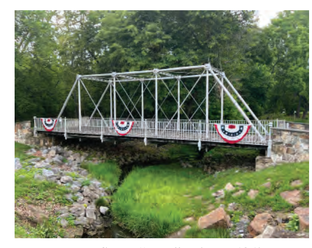
Walnut Street "Pony" Bridge - 1860

Looking across the street, you will see Northampton County Bridge Number ______, repaired in 1950 and restored in 1999. This bridge was the original Walnut Street bridge in Hellertown, and was erected circa 1860. This is the only High Truss span known to exist. The bridge was added to a list of national historic sites and received its official certification on June 13, 2023. Further information, along with historical photographs on the Walnut Street "Pony" Bridge can be found here: <a href="https://historicbridges.org/bridges/browser/?bridge-browser=pennsylvania/hellertownwalnut/">https://historicbridges.org/bridges/browser/?bridge-browser=pennsylvania/hellertownwalnut/</a>