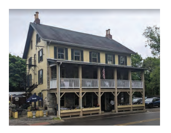
Riegelsville Inn - 1838

Riegelsville Inn - The Riegelsville Inn was built in 1838 by Benjamin Riegel, founder of the town. The historic building stands on the banks of the Delaware River across from the Riegelsville Bridge.