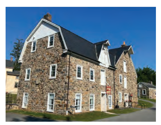
Wagner Grist Mill - 1767

A ______ stands on the south side of Walnut Street. It was built by Stoffel Wagner in 1767. Many of these buildings existed along the Saucon Creek, but only a few remain.