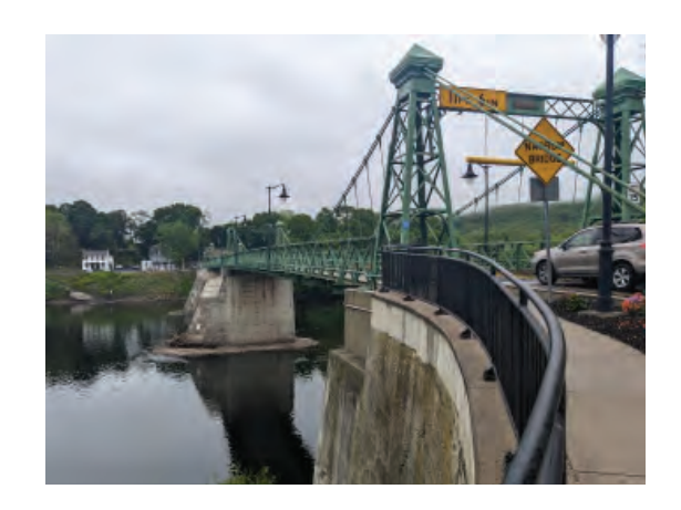
Riegelsville Bridge - 1904

Riegelsville Bridge - The bridge was built by the John A. Roebling & Sons Company, famous for building the Brooklyn Bridge in New York City. More information on the inn and bridge can be found here: <a href="https://riegelsvilleinn.com/history/">https://riegelsvilleinn.com/history/</a>. The Library of Congress has some old photos of the bridge located <a href="here">here</a>. Finally, this website contains additional bridge documentation and why it is historically significant: <a href="https://historicbridges.org/bridges/browser/?bridgebrowser=newjersey/riegelsville/">https://historicbridges.org/bridges/browser=newjersey/riegelsville/</a>.