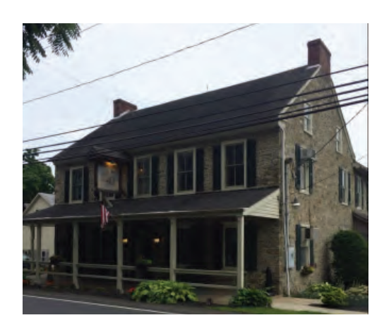
Springtown Inn / Colonial Tavern

Springtown Inn - Built c. 1830 by Christopher Witte. The village of Springtown was established in 1763. More information on Springtown and the inn can be found here: <a href="https://www.springtowninn.com/history">https://www.springtowninn.com/history</a>. Notice the porches which extend over the sidewalks on some of the buildings in Springtown.