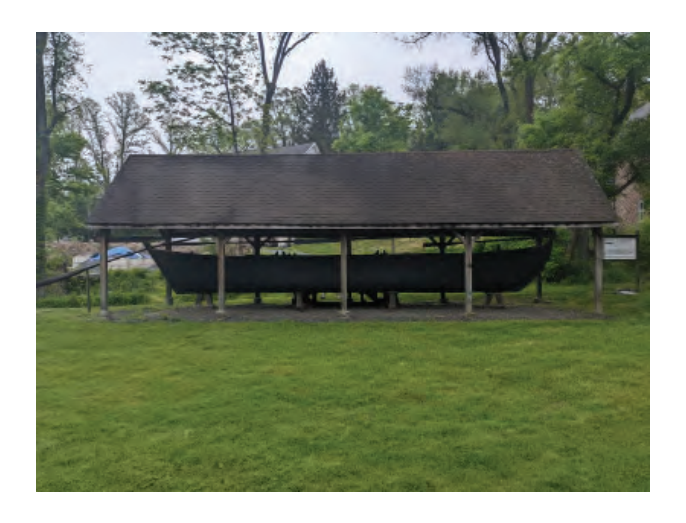
Replica of Durham Boat