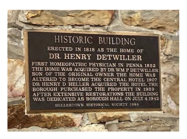
Hellertown Borough Hall - 1942