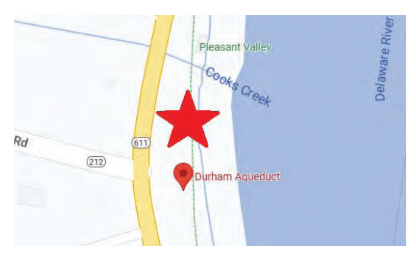
End of Trail - 1499 Easton Road, Kintnersville, PA 18930