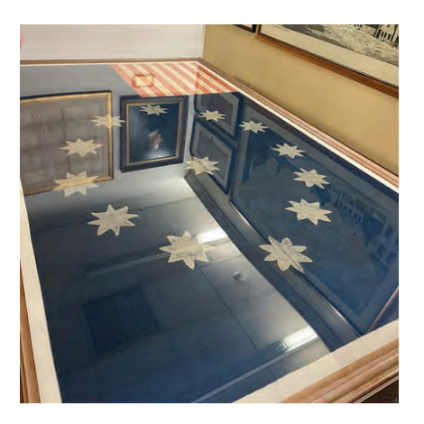
The Easton Flag - 1776

Go inside the library ( if you arrive during library hours ). The first Stars and Stripes of the United Colonies was unfurled at Easton, Pa. on July 8, 1776. It is now displayed in the library's historical room. You must sign in as a guest to see the flag. The body of the flag has the field of stars with ______ stars forming a circle and _______ star(s) in the center. The occasion for the first display of this flag at the old courthouse was the first public reading of the Declaration of Independence.