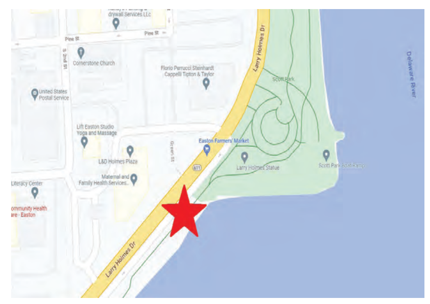
Start of Trail - Scott Park, Easton, PA 18042