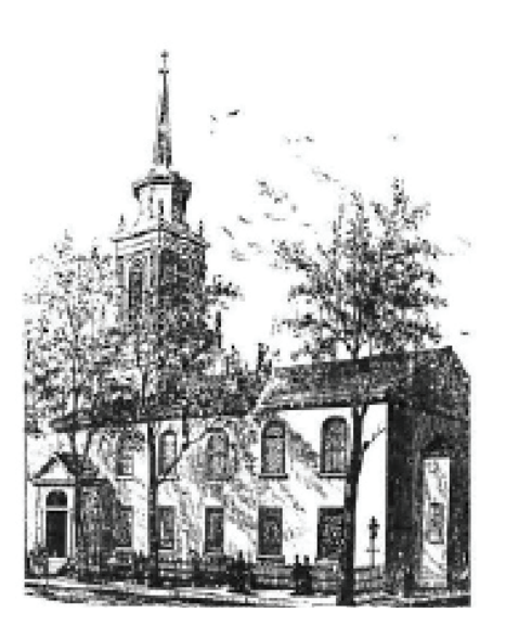
Former First Reformed Church - 1775