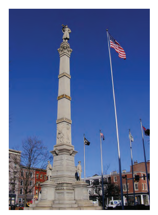
Easton City Square and Monument