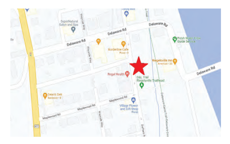
End of Trail - 711 Durham Rd, Riegelsville, PA 18077