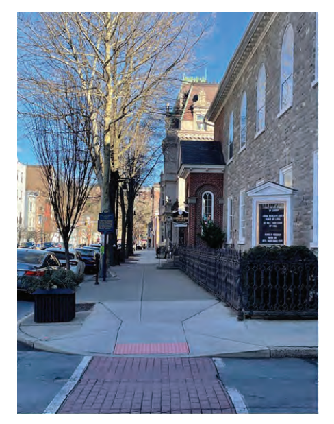
First United Church of Christ

• Proceed one half block north of the old city square