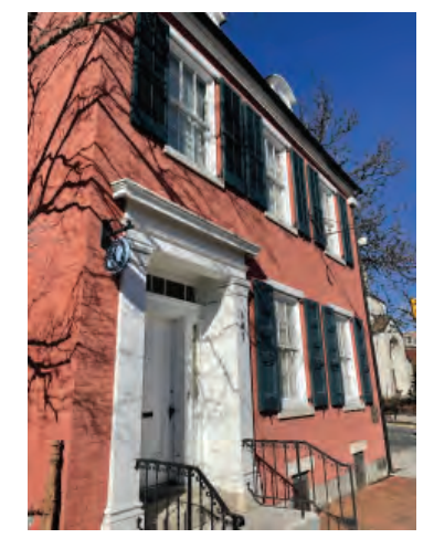
Mixsell Illick House - 1833

The old brick building was erected in 1833 and rests on a stone base and has a sloping slate roof with _____ dormer windows in front. The old weather beaten wing in the back is enclosed by an antique cast iron fence, with a grapevine pattern. The interior, in conformity with the outside, has neat white baseboards throughout, 5 marble fireplaces, old portraits, and prints hung on the buff walls. Hanging in the lobby is an old wrought brass chandelier. A finely carved colonial staircase leads from the lobby to the second floor, where there are Indian, Colonial, Revolutionary War, Civil War, and other period exhibits.