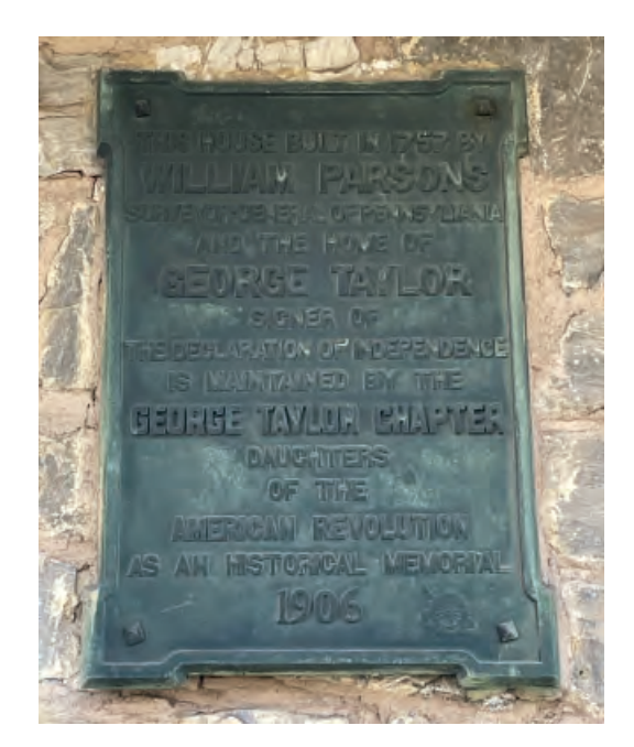
Plaque commemorating the Parson/Taylor House