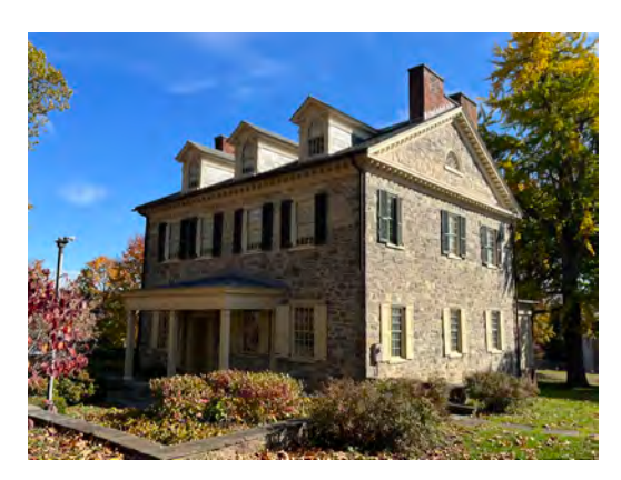
Trout Hall - 1770

• Proceed in a northwesterly direction (300 degrees) to the intersection of South Fourth St. and Union St. Head north across this intersection and continue on the west side of Fourth St. towards Walnut St.