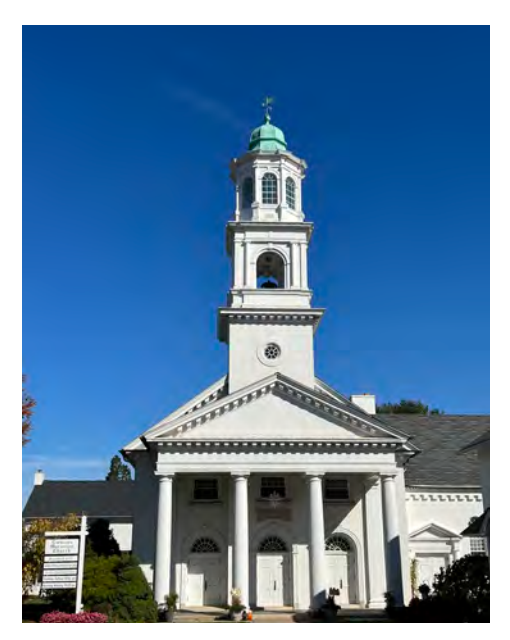
Emmaus Moravian Church

A school house of log construction was opened east of the present church on February 6, 1747. Forty children were enrolled. By June of the same year, the day-school was extended to include a boarding school. An Indian boy was among those early pupils. The cost of board and schooling was six pound sterling per year (about $14-$15).