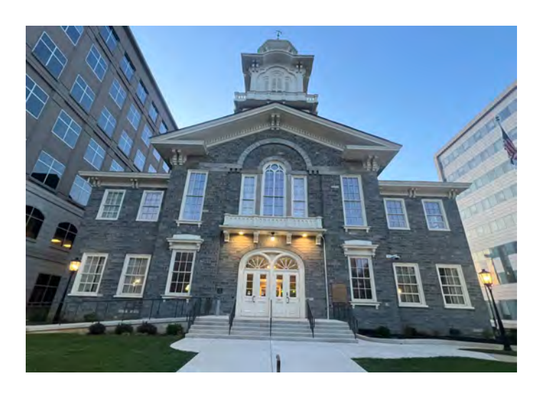
Old Lehigh County Courthouse

This trail has taken you through various places of our local history. You have seen or been where the Native Americans lived and fought, where our first inhabitants felt the conflict and agony of our struggle for independence from England, memorials pertaining to the War of 1812, activity of the Civil War and World War I. There are numerous other places of interest in our community that may he covered by other hiking trails. These other points are well worth investigating.