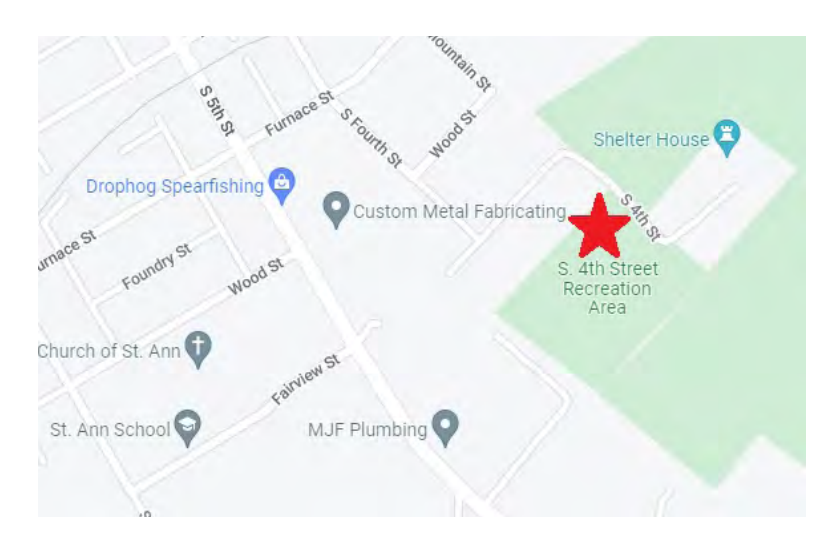
Start of Trail - 601 South 4th Street, Emmaus PA