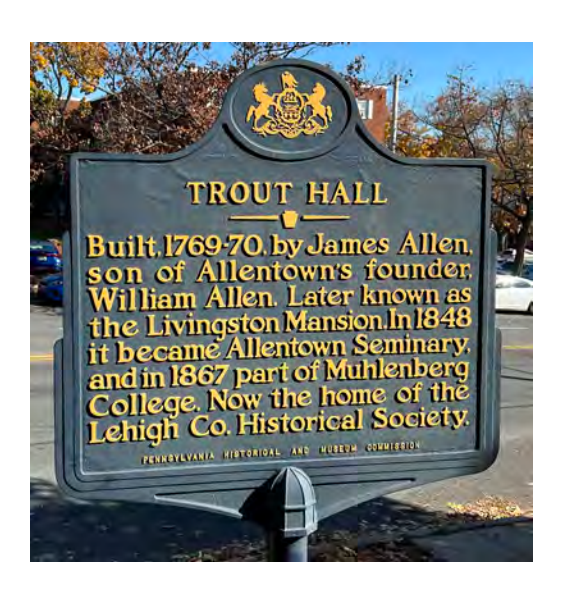
Trout Hall Historical Plaque