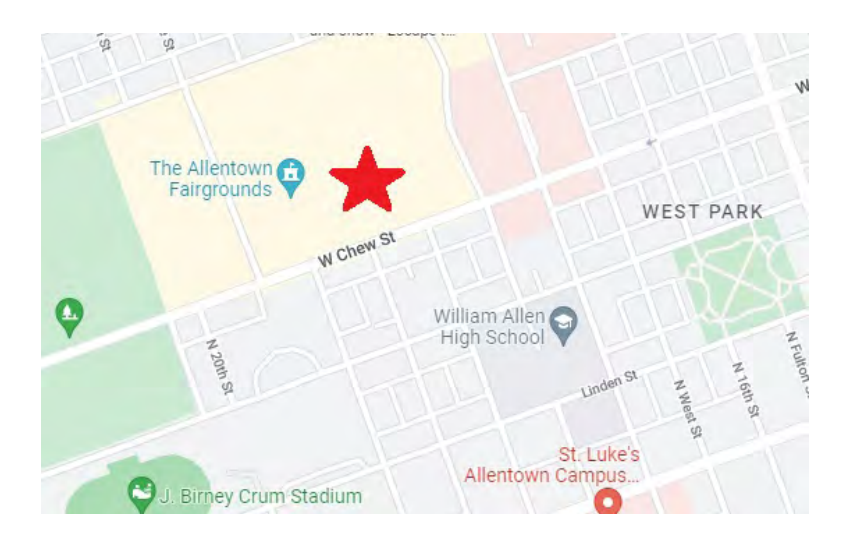
End of Trail - 1825 Chew Street, Allentown, PA