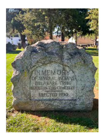
The Western Salisbury Church