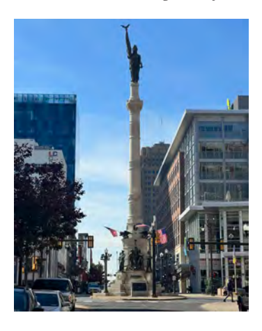
Soldiers and Sailors Monument - 1899

• Continue west on Hamilton St. to Seventh St. Cross Hamilton St. to the northeast corner. On the building look for a HISTORIC PLAQUE