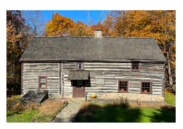
The Shelter House - 1743