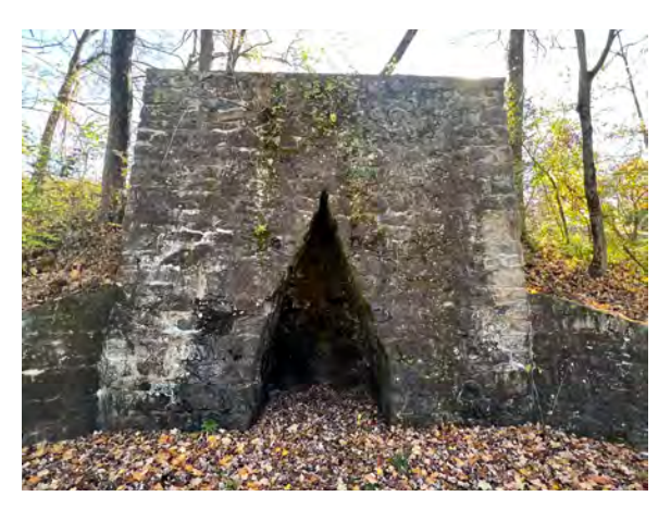
Old Lime Kiln

• Continue down stream from the low bridge until you come to an old stone structure in the bank on your right.