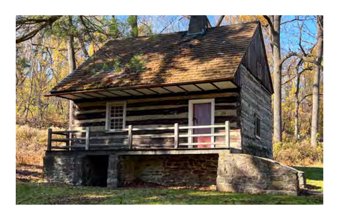
The Hunter's Cabin - 1741

The Hunters Cabin was built in 1741 and restored in 1938. It is a typical cabin of logs with lime-sand mortar between the logs. It is a _____ room cabin with a central fireplace and kitchen. The entrance door opens into the kitchen. There are no other doors. The beam-supported roof has wood sided gables and a slanted wood shingled roof with a stone chimney. A patent for this cabin was taken out 2 years after the "Walking Purchase".